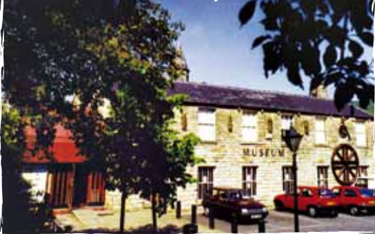
Saddleworth Museum and Art Gallery

A good walk with some strenuous hilly sections. The route takes in the Huddersfield Narrow Canal, country lanes, weavers' cottages and Saddleworth Church before returning through the village of Uppermill. There are a number of options to shorten the route along the way or to avoid some of the hills.