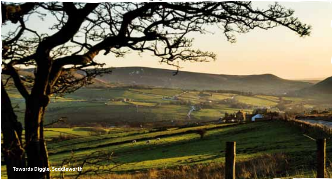
Towards Diggle, Saddleworth